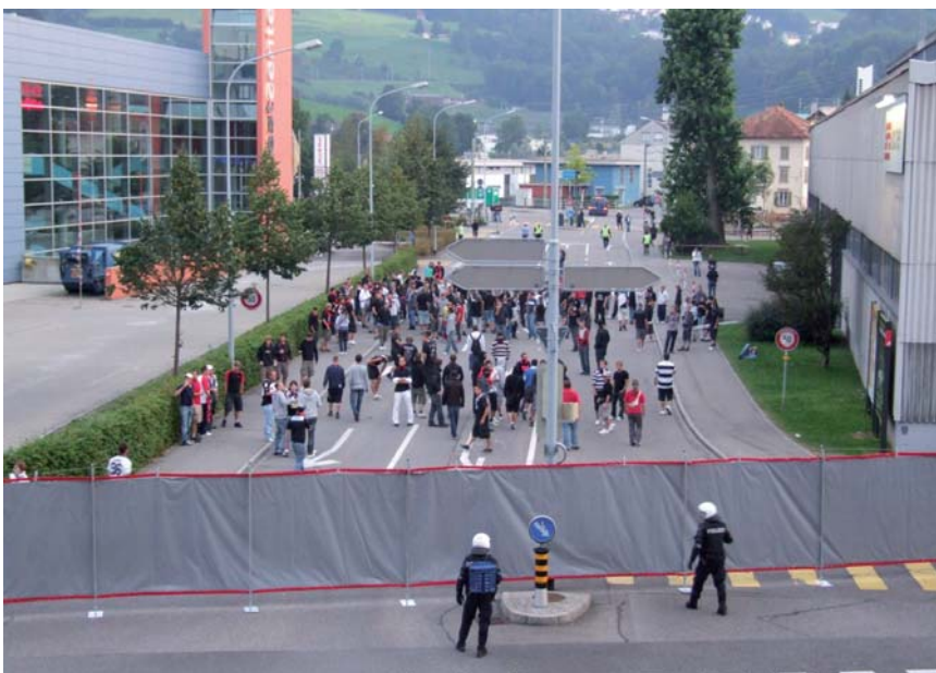
The last visiting team fans make their way to the Winkeln railway station.