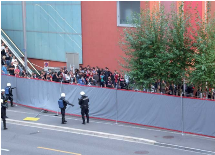
The rollaway fence is standing up to the attack.