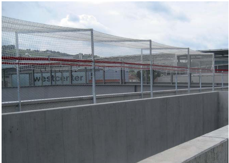
Stationary FENCEBOX® roof for visiting team fans: protects against thrown objects and prevents throwing of objects.