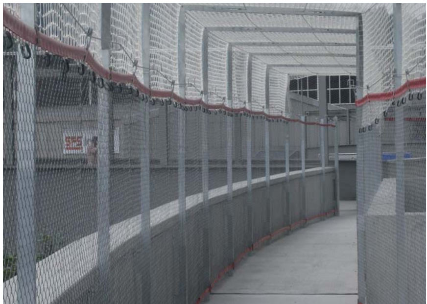
Visiting team fans after the game, on the way home in the stationary FENCEBOX® passage with roof protection.