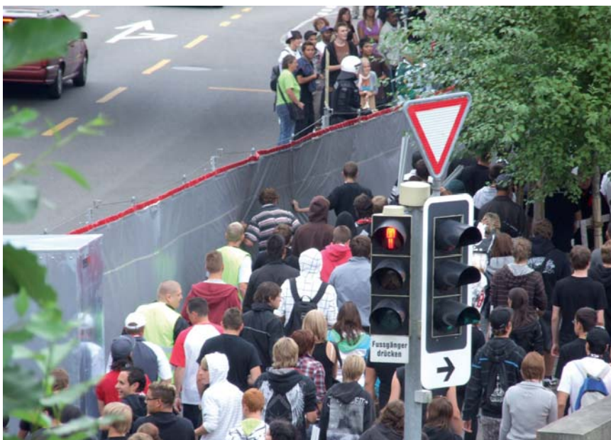
Visiting team fans on the march, with curious St. Gallen fans behind the sight-screen.