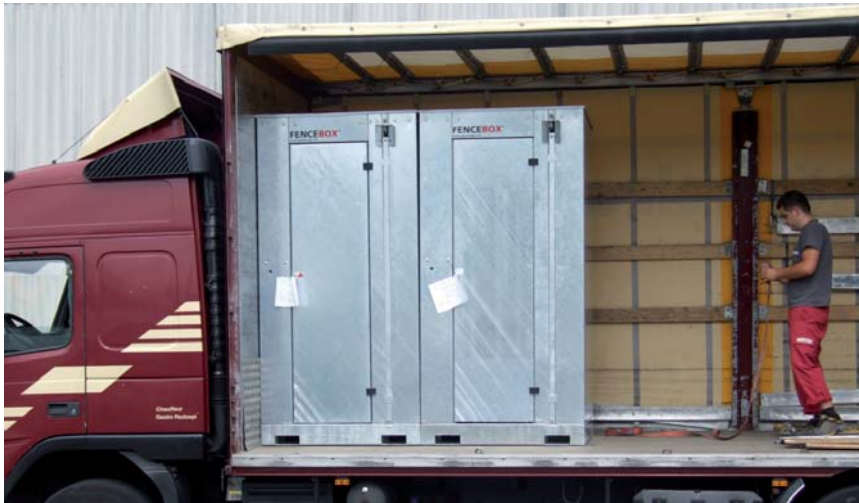
Mobile FENCEBOX® rollaway fences are unloaded ...