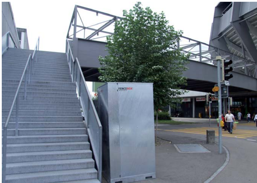
The Herisauerstrasse crossing of the four-lane Zürcher Strasse is closed off by a sight-screen.